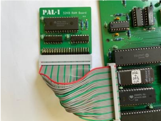
Connect by cable

Then, open the memory selector jumper on PAL-1 to complete RAM expansion.