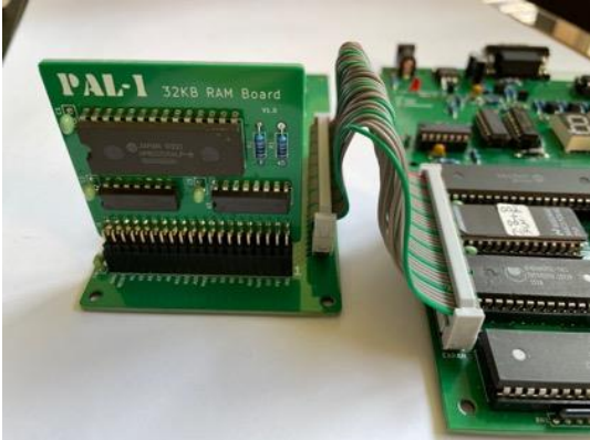
Connect via mainboard

After connected, the computer system looks like this: